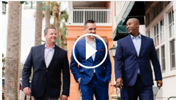
Fast growing and dynamic PSI Groups joins Integrity to accelerate expansion