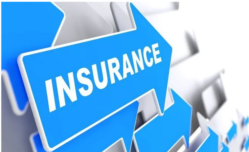
Insurance industry news from Cadence Insurance, Signal Restoration Services, and more.

Cadence Insurance (https://cadencebank.com/), Inc. acquired certain assets of Houston, Texas-based Warriner & Associates Insurance Services (http://warrinerandassociates.com/), Inc. and Warriner Solutions (https://warrinersolutions.com/), LLC, effective December 1, 2022. Warriner & Associates has specialized in insurance coverage and consulting for the for-hire